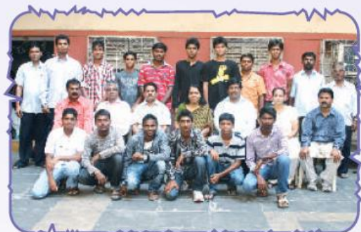
Jr. College Cricket team : Winners of the C.K. Naidu Cricket Trophy 2010