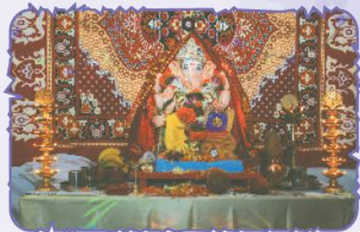
Lord Ganesh, during the Ganesh Chaturthi Celebration organized by non-teaching staff.