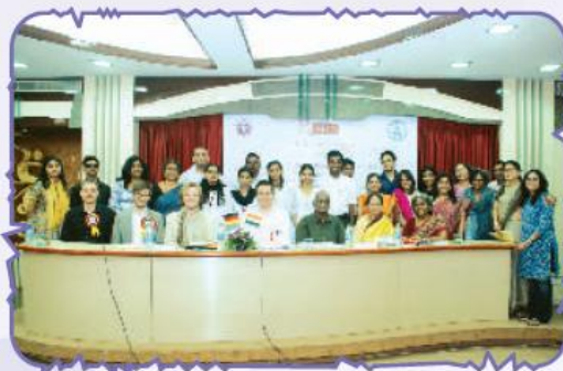
Participants with the guests at the Indo – German Colloquium.