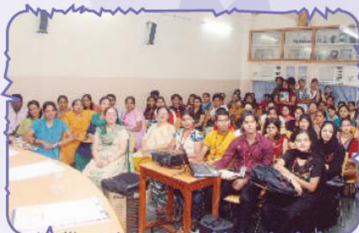
"Workshop Conducted by WDC on Gender Sensitivity"