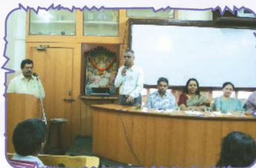
Summer Course in Physics