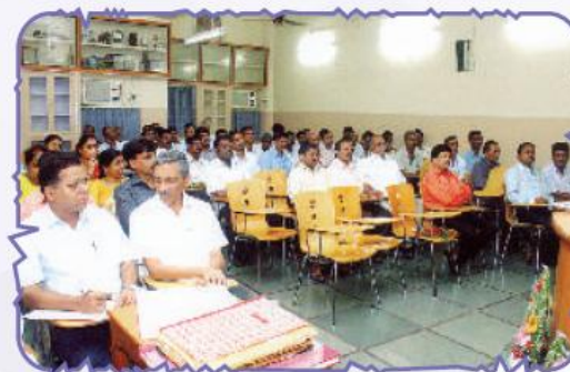
Non Teaching Staff Welfare Fund : 12th Annual General Meeting, 2010