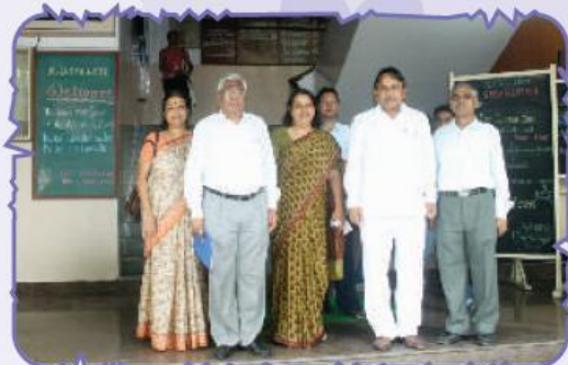
Members of Academic Audit with Principal and her team