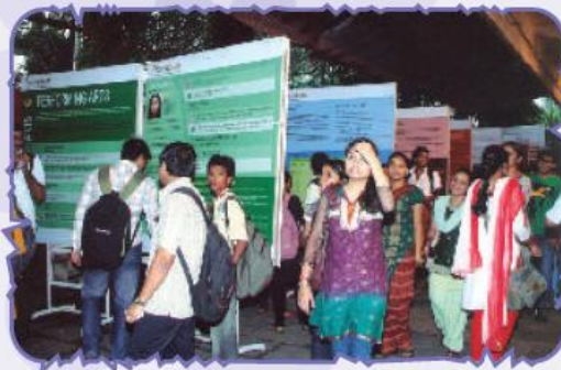
Career Fair - VISTAS 2010