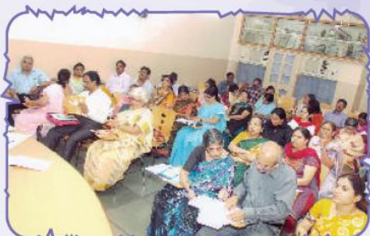
Delegates attending Workshop on Revised syllabus for TYBSc Statistics (Practicals)