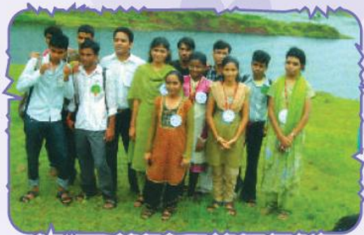
Geo Club - Educational tour to Bhivpuri