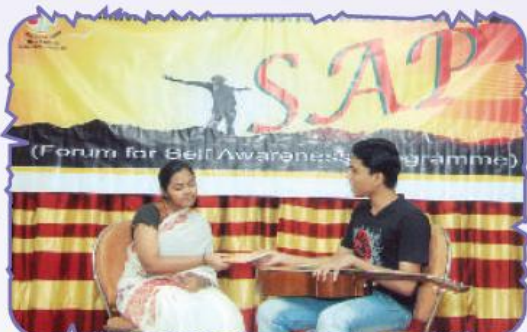
SAP Utsav : Skit on Inner Connect