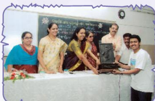
Late Shree Jugaldas Damodar Modi Intercollegiate Marathi Elocution Competition.