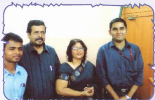
Student Speakers of S.Y.B.Sc. and Chairpersons of Space Point Club Presentation on "Universe Through Lens."