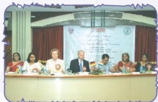
Inaugural Function of Indo – German Colloquium.