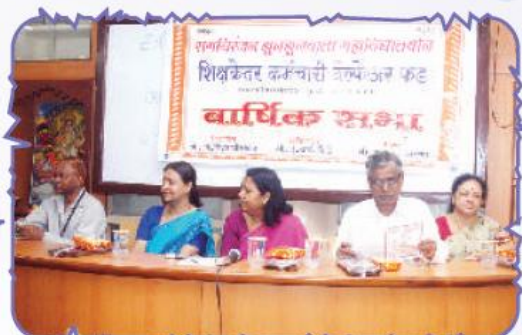
Non Teaching Staff Welfare Fund : Meeting in Progress.