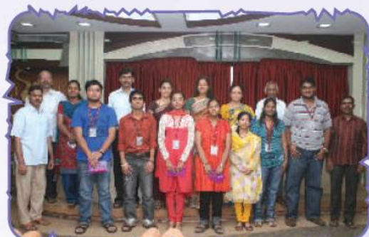
Winners of the Book Review with the library staff.